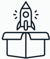
Speed-to-Launch or Transform

Savana's Customer Experience is a launchpad for getting to market quickly with a bespoke online/mobile banking and account opening experience. Launch faster and differentiate your institution with complete control of your bank's digital experience.