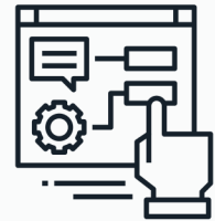
Core-to-Customer Control of Your Experience